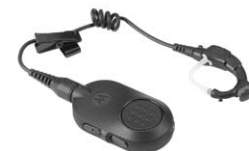
Operations Critical Wireless Earpiece

“When I first saw the MOTOTRBO SL Series I thought that it was a cell phone, not an actual two-way radio. It has all the capabilities of a two-way radio but with a professional, discreet look that fits absolutely well with all our uniforms.”