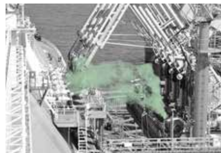
Gas Colorized Mode