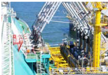
Standard Color Image

EyeCGas® FX includes a highly sensitive IR camera and an HD color camera for fast recognition of the areas being inspected. The camera allows safe and ongoing monitoring of all areas of the plant, including remote and inaccessible areas. Video can be saved locally (on the camera) or remotely (feed sent to control room).