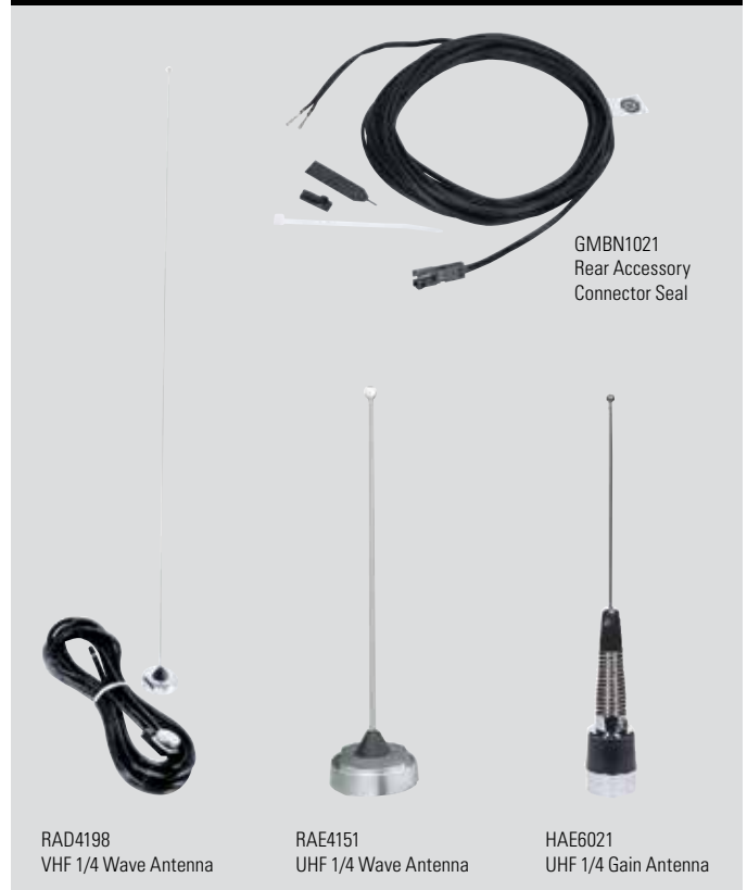
RAD4198 VHF 1/4 Wave Antenna